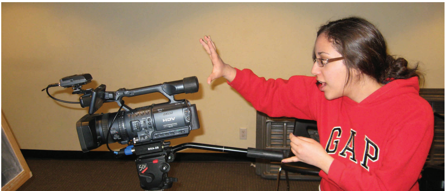
2009 No Hate Filmmaking Boot Camp.